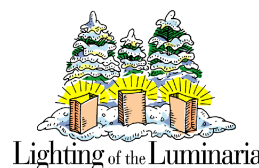
Lighting of the Luminaria

We are needing a Sunday School Class, a family or any group of volunteers to light the Christmas luminaries before the 11:00 pm Christmas Eve service. Call the church office at 667-5435 for more details or to volunteer.